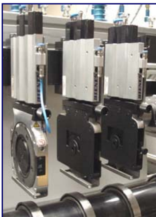
Quik-Change blade heads for Shear, Crush and Razor slitting